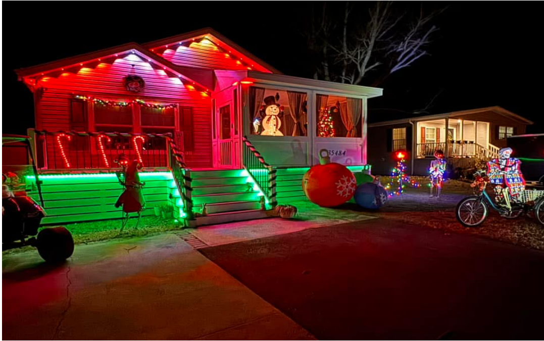
New Year's Eve in Mariner's Cove