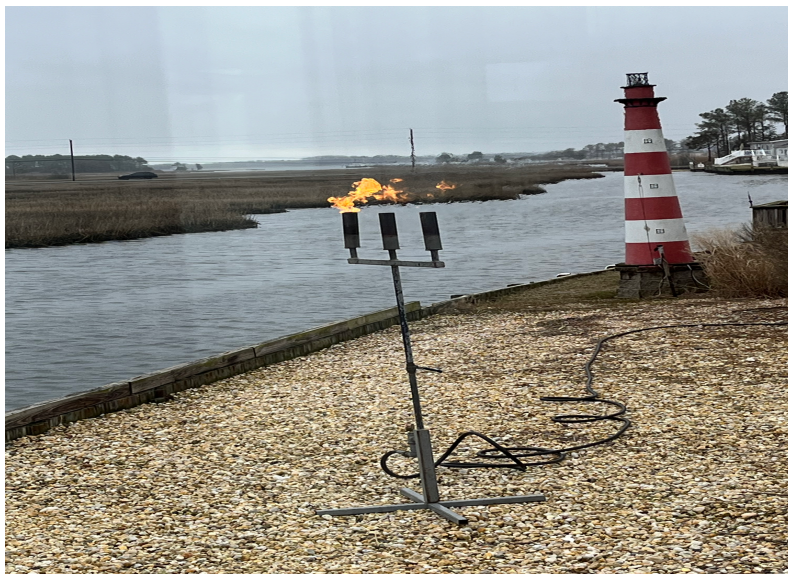
Gas from submerged community tanks being burned off, emptied and permanently closed by SHARPE in our neighborhood. Individual gas tanks were installed three years ago for residences which had been using the community tanks.