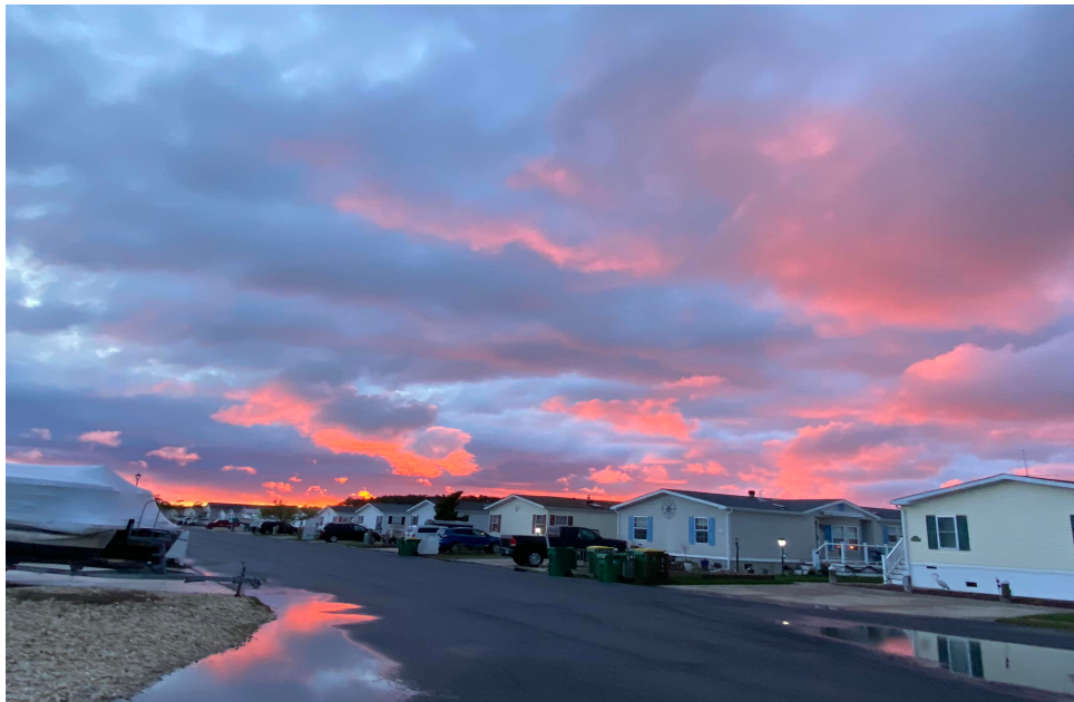
Sunset at Knoll Way - Betsy Keppley (posted on Mariner's Cove FB page)

Here are some views around our neighborhood